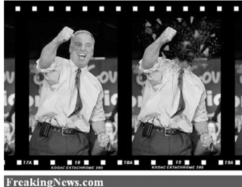
Figs. 6.1 and 6.2. The cybercommunity turned on Howard Dean following his concession speech after the Iowa caucuses, resulting in many different Web parodies.

him howling as he gropes Janet Jackson, shouting at a kitten, or simply exploding from too much pent-up passion (figs. 6.1 and 6.2). All of which suggests a moment of transition where the political role of the Internet is expanding without diminishing the power of broadcast media.