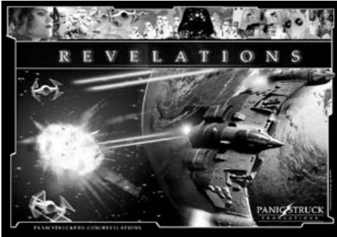
Fig. 4.2. Publicity materials created for Star Wars: Revelations , a forty-minute opus made through the combined efforts of hundreds of fan filmmakers worldwide.

movie studio. There's nothing to stop you from doing something provocative and significant in that medium." 15 Lucas's rhetoric about the potentials of digital filmmaking has captured the imagination of amateur filmmakers and they are taking on the master on his own ground.