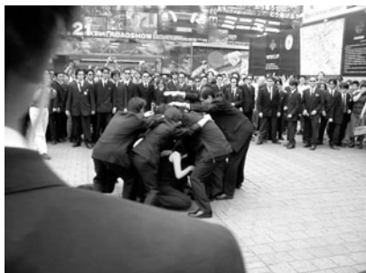
Fig. 3.2. Japanese fans gather in Osaka to reenact scenes from The Matrix Reloaded .

Tokyo's Yoyogi Park on a Sunday afternoon, all dressed up and ready to play, there have been a series of Matrix reenactments (fig. 3.2). Hundreds of local fans arrive in costume and systematically stage key moments from the movies as a kind of participatory public spectacle. 10 These reenactments in effect localize the content by reading it through nationally specific fan practices.