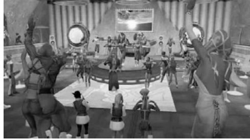
Fig. 4.3. Each character in this musical number from The Gypsies' Christmas Crawl 1 , made using the Star Wars Galaxies game, is controlled by a separate player.

To distribute all of this content, fans have created a range of online sites. Perhaps the most elaborate and best known of these is "The Mall of The Sims ." Visitors can browse at more than fifty different shops that offer everything from the most up-to-date electronics to vintage antiques, from medieval tapestries to clothes for hard-to-fit sizes—and skins that look like Britney Spears or Sarah Michelle Gellar or, for that matter, characters from Star Wars . The Mall has its own newspaper and television service. At present, the Mall boasts more than 10,000 subscribers. Wright notes that the success of the franchise just about led to the extinction of the fan