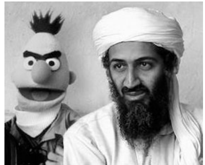
Fig. I.1. Dino Ignacio's digital collage of Sesame Street 's Bert and Osama Bin Laden.

CNN reporters recorded the unlikely sight of a mob of angry protestors marching through the streets chanting anti-American slogans and waving signs