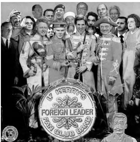
Fig. 6.3. Photoshop images spoofing the presidential campaign became part of the grassroots media war promoting and criticizing the candidates.

The use of images may be blunt, as when Bush's face is morphed into Hitler's or Mad Magazine icon Alfred E. Neuman, or when Kerry's face gets warped to look like Herman Munster. Some of the images can be much more sophisticated: when John Kerry claimed that he enjoyed the support of many foreign leaders, one satirist put together a mock version of The Beatles's Sergeant Pepper's Lonely Hearts Club Band (1967) album cover with dozens of infamous dictators and terrorist leaders lining up behind the Democratic nominee (fig. 6.3). These Photoshop