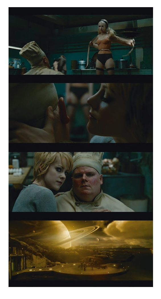
Fig. 6.1 Babydoll invites the male gaze in Sucker Punch (Zack Snyder, 2011)

pictures. Costumes also featured tassels, feathers, sequins, elaborate head-dresses, and other 'feminine' signifiers and were often designed to emphasize the breasts and pelvis. Hyperfemininity in the costuming, while drawing attention to sex, simultaneously functioned as a virtual 'masquerade,' taking on parodic overtones." While the clothes and accoutrements of performed femininity in Sucker Punch do not follow this precisely, though many of these elements are in fact present, nevertheless the flaunt-