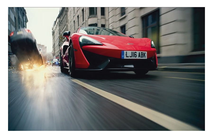
Fig. 2.4 A silver sedan slams into a Lexus in Transformers: The Last Knight (Michael Bay, 2017)