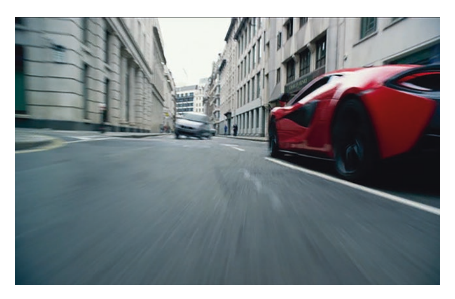
Fig. 2.2 A Mazda 3 swerves to miss the oncoming McLaren in Transformers: The Last Knight (Michael Bay, 2017)

violent dance of the two colliding vehicles is seen again, however, the front ends of the vehicles never touch and the silver sedan flies inexplicably through the air, while the back end of the Lexus shoots upward with explosive power (Fig. 2.5). This is subsequently followed with the great raining down of newspaper and debris—the explosive mini-climax within the chase scene is characteristically Bay. Perhaps the strangest of all elements in is found in Fig. 2.3 where the passing silver hatchback does not pass the McLaren, but is momentarily superimposed on it. This is only noticeable when going frame-by-frame, but this is a clear artifact of CGI animation (Figs. 2.2, 2.4, and 2.6).