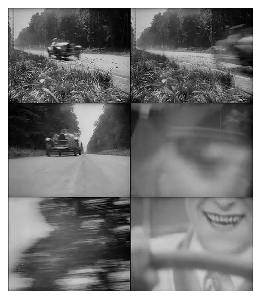
Fig. 2.7 Racing down country roads in Jean Epstein's La glace à trois faces (The Three-Sided Mirror) (Jean Epstein, 1927)

II). (Recall that, above, Lutz Koepnick cited the affinities between Bay's depiction of frenetic action to that of the futurists as well.) "When new technologies are once again promising unprecedented heights of iconic fidelity," Balsom also notes, "filmmakers are once again turning against the automatic production of exact likeness, in search of blurrier, smudgier