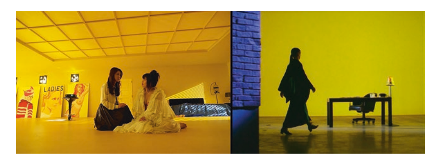
Fig. 3.2 On the left Antiporno (Sion Sono, 2016), on the right Pistol Opera (Seijun Suzuki, 2001)

portraits) allow for some interesting lighting effects during the film. Four vertical windows—adjacent to the wall with portraits—motivate the wash of light filling the room. The open stage-like set (at one point there is a cutaway to a scene played out on an actual stage), Antiporno allows much of the film to unfold on effectively a blank slate, a blank canvas on which diatribes share the stage with fetishistic and sadistic treatments of female bodies. Given license with the rebooted Roman Porno line, Sono at once strictly "colors within the lines," but by the same stroke, does so with such veracity that it challenges the integrity of the entire (genre) system.