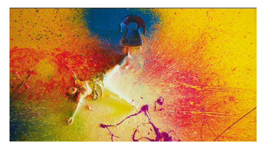
Fig. 3.1 The vivid and wild conclusion of Sion Sono's Antiporno (Sion Sono, 2016)

simply because of its titillating exhibition of bodies, and sex). The film ends with Kyoko repeatedly pleading "Where is the exit?" a practical effort to extricate herself, and at the same time serving as a dummy to the screenwriter-ventriloquist, Sono, who wonders out loud how he will possibly resolve the narrative (such as it is). He doesn't.