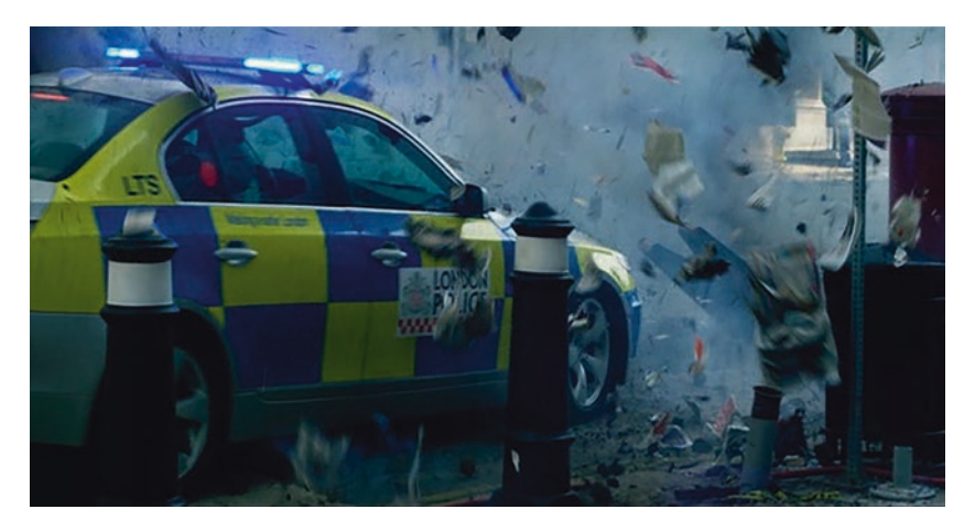
Fig. 2.6 The great raining down of newspaper and debris—the explosive mini-climax within the chase scene in Transformers: The Last Knight (Michael Bay, 2017)

vehicle, kicking up a storm of leaves. Likewise, we also get mobile shots mere inches off the ground, again, quite similar to shots found in Transformers: The Last Knight . Shots of blurred countryside give us little