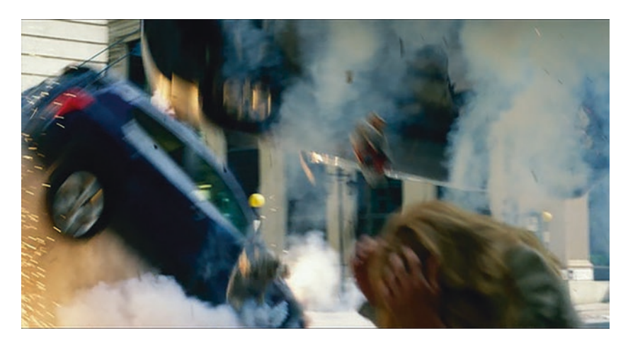
Fig. 2.5 The back end of the Lexus shoots upward with explosive power in Transformers: The Last Knight (Michael Bay, 2017)