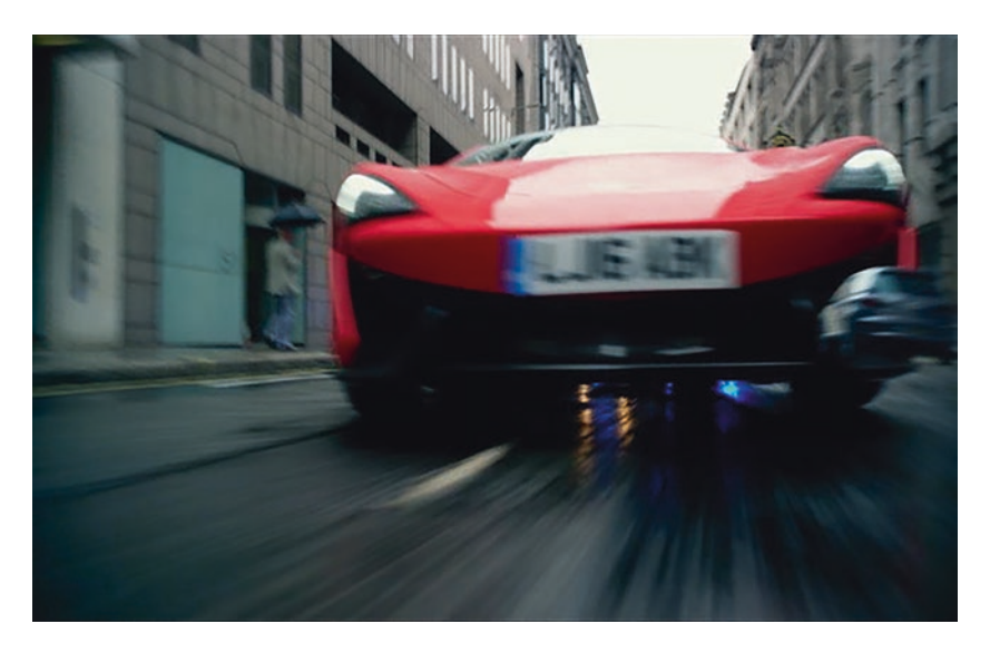
Fig. 2.3 A Mazda 3 passes the oncoming McLaren in Transformers: The Last Knight (Michael Bay, 2017)