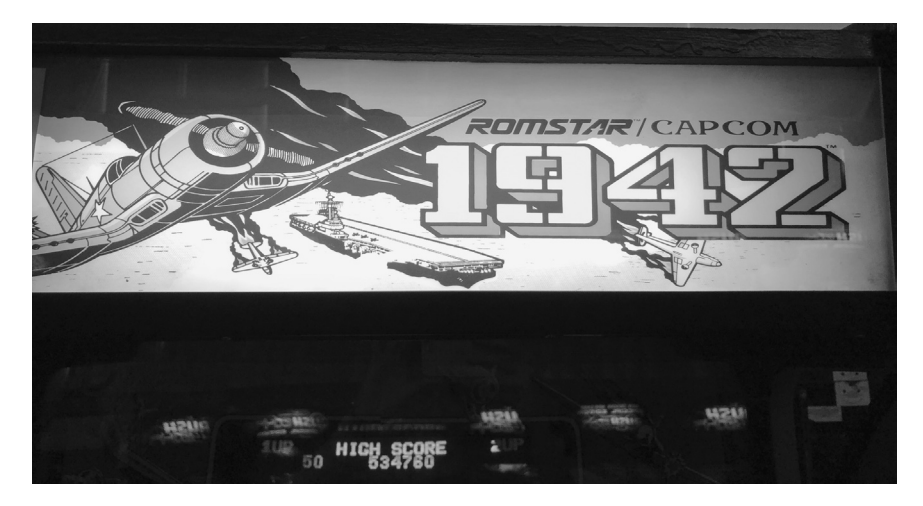
Figure 7.1 Cabinet art for 1942 .

1942 is a shooting game from Capcom, released for arcades in 1984 (Figure 7.1). The player's 'Super Ace' plane is a thinly disguised Lockheed P-38 Lightning, one of the most efficient Allied warplanes in WWII. The setting is the Pacific Theatre, and the player's goal is to destroy the Japanese air fleet in order to reach Tokyo. The game is a vertical scroller, where enemy planes move quickly around the screen to shoot at the player's P-38, while the player can move their aircraft freely to shoot targets or avoid fire. The map unfolds below the player, a constantly scrolling background of bright blue ocean and green islands. 1942 is an exciting, adrenalin-fuelled shooter or STG in the classic arcade style, designed by Okamoto Yoshiki. It had a long shelf-life, reissued for play on Nintendo systems and part of the Classic Capcom Collection released for PS2 and Xbox in 2005.<sup>39</sup> An interesting feature of this game is the use of real historical planes and ships to represent the player and their enemies. The P-38 has a distinct silhouette, while enemy planes are also recognizable as Kawasaki Ki-61s, Mitsubishi A6M Zeros and Kawasaki Ki-48s. The main boss at the end is the 'Ayako,' clearly a Nakajima G8N, a formidable bomber with four engines that appears massively outsized on the screen. Pictures of the airplanes appear on the arcade cabinet, while the player's 'Top Secret' mission is also displayed to the