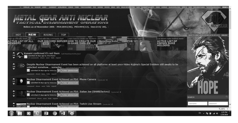
Figure 8.1 Metal Gear Anti Nuclear Reddit page.

In response, Konami began tracking numbers again in May 2016, but at the time of writing complete disarmament has yet to be accomplished. Kojima comments: