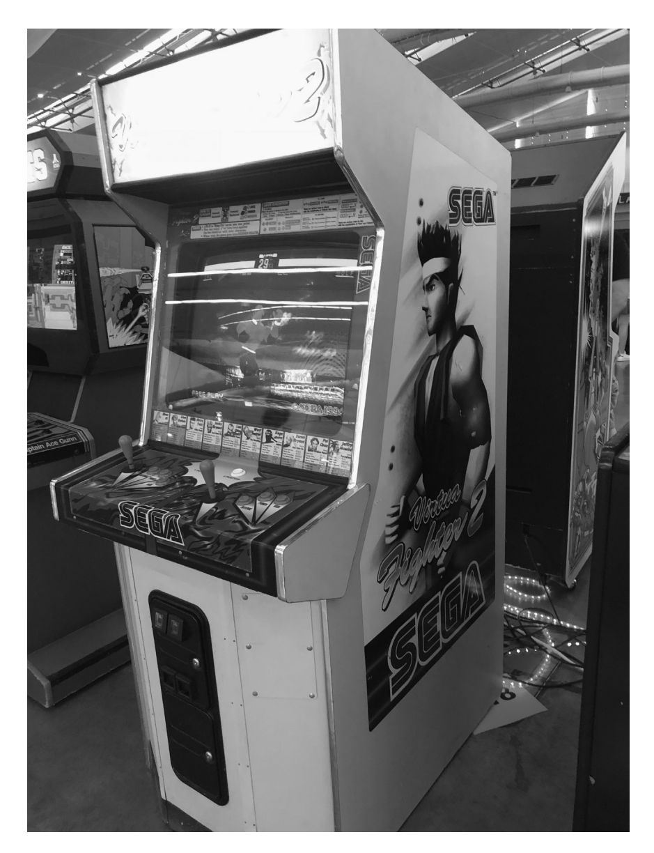
Figure 3.5 Cabinet art for Virtua Fighter 2.