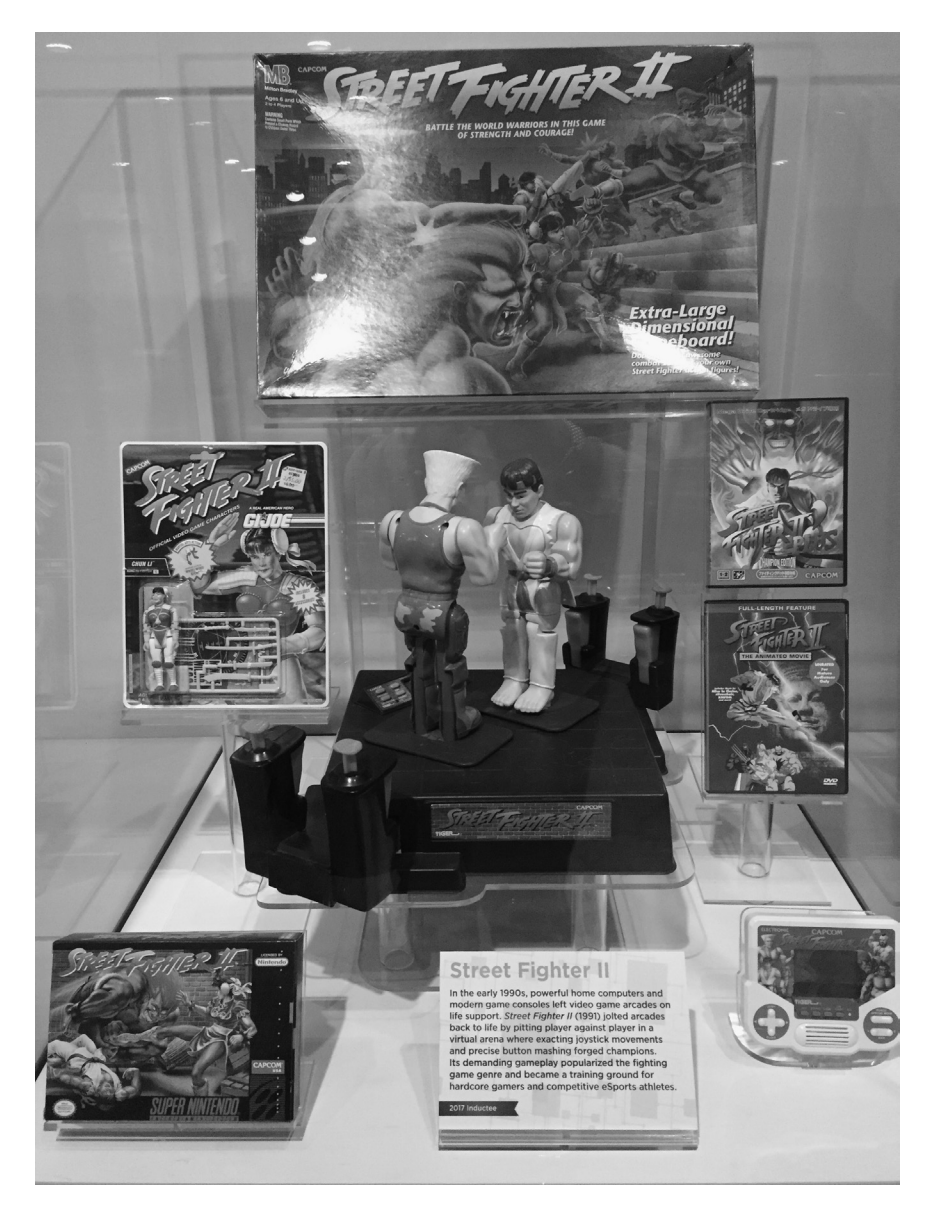
Figure 3.2 Ryu versus Guile at the World Video Game Hall of Fame.