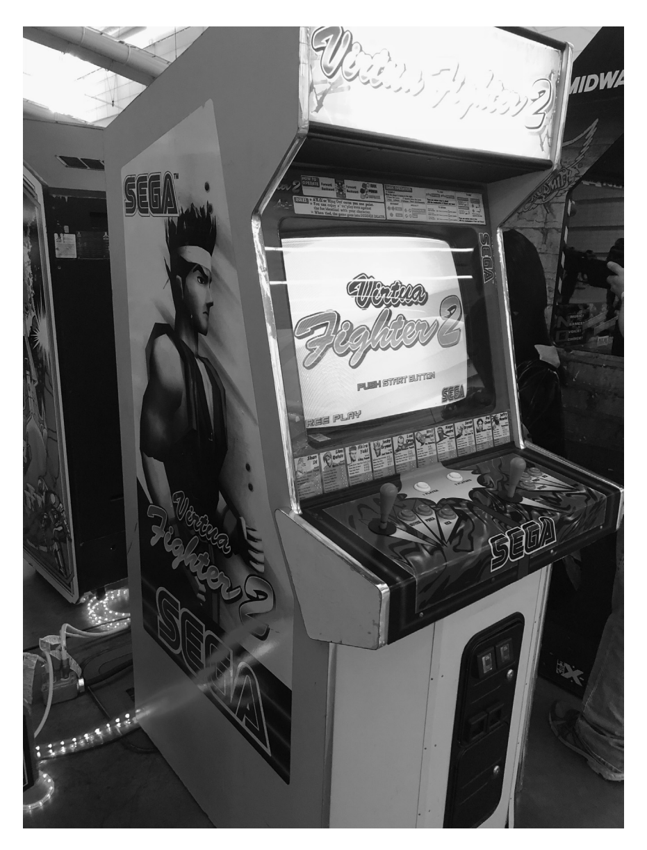
Figure 3.4 Cabinet art for Virtua Fighter 2.