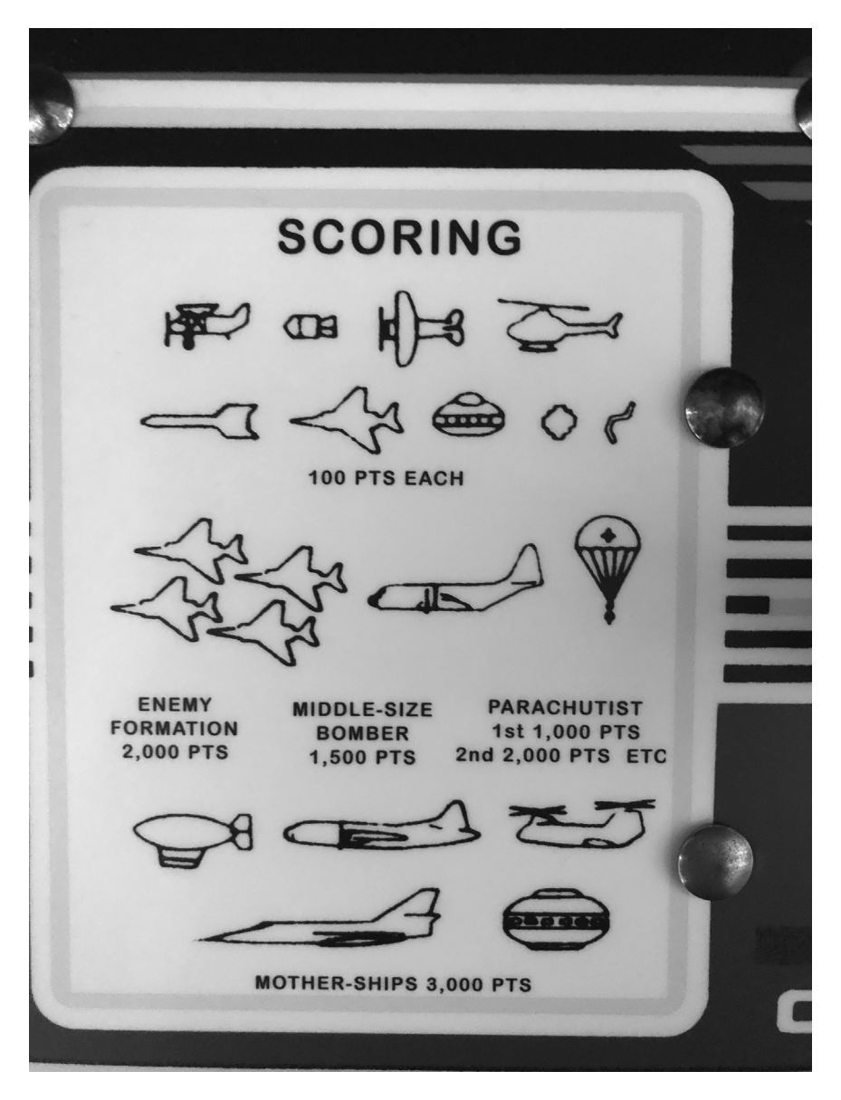
Figure 7.2 Aircraft depicted in Time Pilot