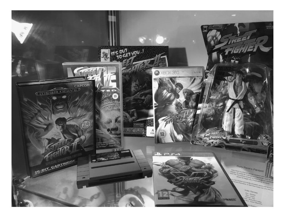
Figure 3.3 Ryu as the face of Street Fighter . Photograph by the author, courtesy of the National Videogame Museum.

move the joystick away from Ryu's avatar in order to play as a different character. If no selection is made by the player, action begins with Ryu when the time runs out. Ryu's icon also appears in the top left of the character select screen, visually occupying the first possible position. Text on the front of the arcade cabinet appeared in a left-to-right direction (with Japanese instructions also written horizontally), so the eve naturally came to rest at this point. Similar tactics applied to later editions of Street Fighter II – one of the most interesting is Champion Edition, with pictures of the characters permanently positioned around the outside of the screen. Ryu in this case appears in the top right corner. Later game series also kept this idea, with the most normative male Japanese character filling the default P1 position in the select screen for the first title in each series. In Virtua Fighter, this position is held by karate fighter Akira Yuki, while the default character in Tekken is karate expert Kazuya Mishima. Soul Edge placed Mitsurugi, the samurai sword-fighter, in this position, and he is the first character to appear in the cinematic sequence of the original Soul Edge arcade cabinet in attract mode.35